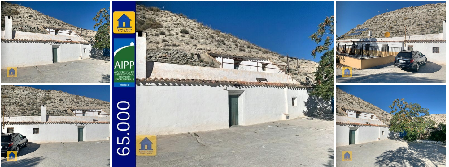
Galera cave josefa

This Spanish-style cave is partially reformed. This is a great renovation project. Set on the edge of Galera, in a very quiet location, this is a large cave on two storeys. There is a very large front patio with fenced garden to the side. The second storey needs full reform and has a balcony facing south with great views over the badlands. There is a large garage/workshop that gives access to another cave and a water deposit. The property is located near the end of the road with two cave properties situated beyond it.