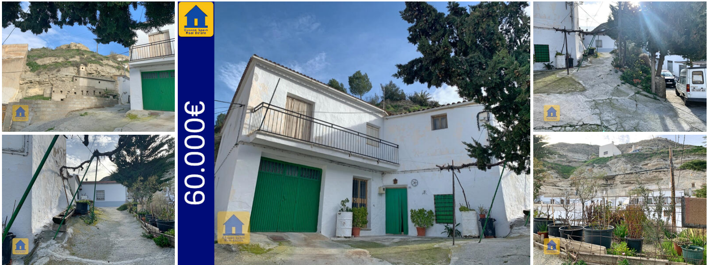
Galera cave house amansio

Lovely large townhouse + cave (about 60% house / 40% cave) located 5 minutes walk from the center of Galera. The spacious patio has a pine tree and views of La Sagra mountain. The house part is reformed in a traditional Spanish style with lots of original character details. The cave part needs reforming (one room is reformed to a basic level).