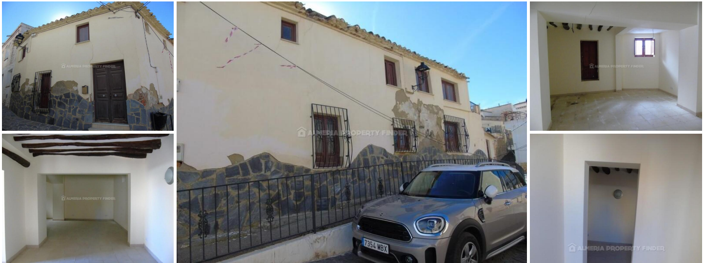
Casa Huertos - A village house in the Purchena area. (Partially Reformed)

Large 3 bedroom, 3 bathroom village house with a 1 bedroom, 1 bathroom guest annexe, situated in the charming village of Sufli in the municipality of Purchena.