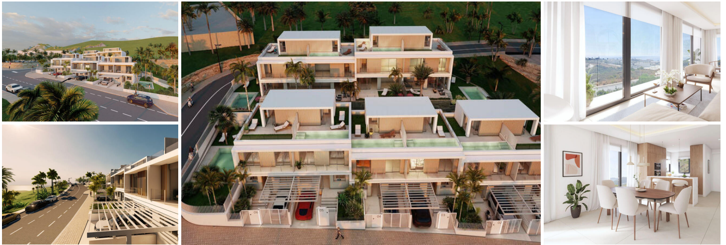
DEL MAR Townhouse - rooftop with private pool - Estepona

DEL MAR townhouse is situated in the western area of Estepona, a residential area that is in full expansion of luxury homes. Only 5 minutes drive from the centre of Estepona, 1,3 km to the beaches. It is right next to the new hospital of Estepona and the new golf course of Azata Golf. Close to restaurants, supermarkets, golf courses and amenities, and only 20 minutes drive from Puerto Banus, Marbella, and Sotogrande, 50 minutes from Malaga international airport and 40 minutes from Gibraltar airport.