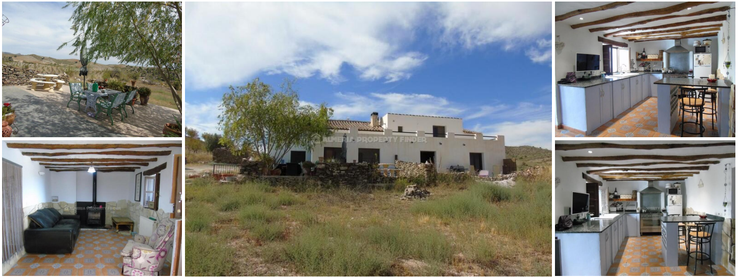
Cortijo Convento - A country house in the Oria area. (Renovated)

A fabulous, partly renovated 156m 2 large country house with 3 bedrooms and 2 bathrooms, which was previously an old convent, for sale in Oria and set in spectacular countryside.