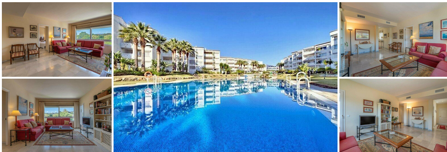
Playa Rocio beachfront urbanisation in Puerto Banus area

Location, Convenience, and Lifestyle! Stunning 3-Bedroom Beachside Flat with Garage and Storage. Nestled within the enchanting beachside urbanization of Playa Rocio, this captivating 3-bedroom, 2-bathroom flat offers an unparalleled coastal living experience.