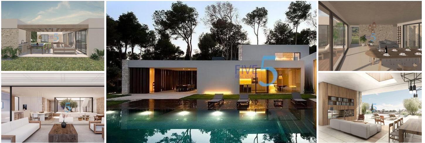
NEW BUILD VILLA IN YECLA, MURCIA

New Build exclusive luxury villa located within a beautiful vineyard in Yecla, Murcia.