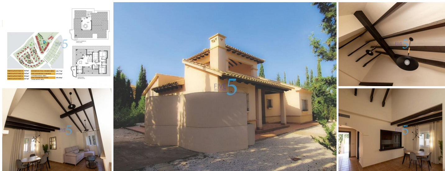
KEY READY VILLA IN FUENTE ALAMO, MURCIA

Residential of townhouses, independent and semi-detached villas in Fuente Álamo, Murcia.