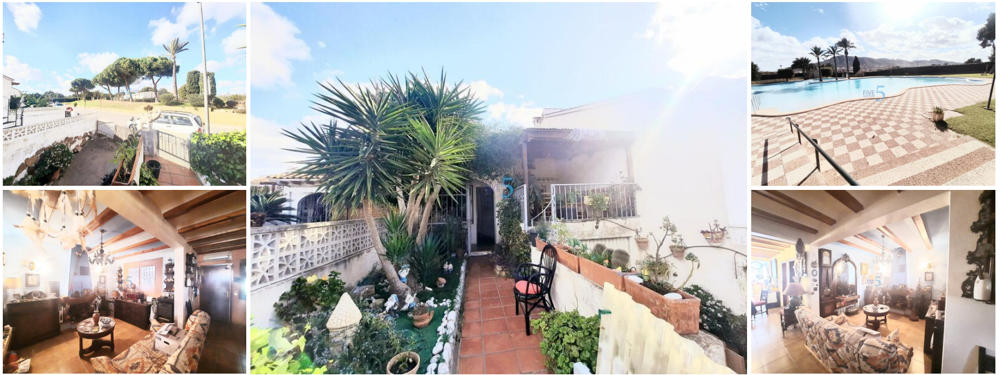
A Cosy 3 Bedroom Town House on the Outskirts of Alfàs del Pi!

We are pleased to present this 3 bedrooms town house located within few minutes drive from stunning Albir beach and all local amenities. This property is situated in one of the quietest villages in the Alicante region - Alfàs del Pi. Only few minutes drive from stunning Albir beach and 15 minutes drive from Benidorm.