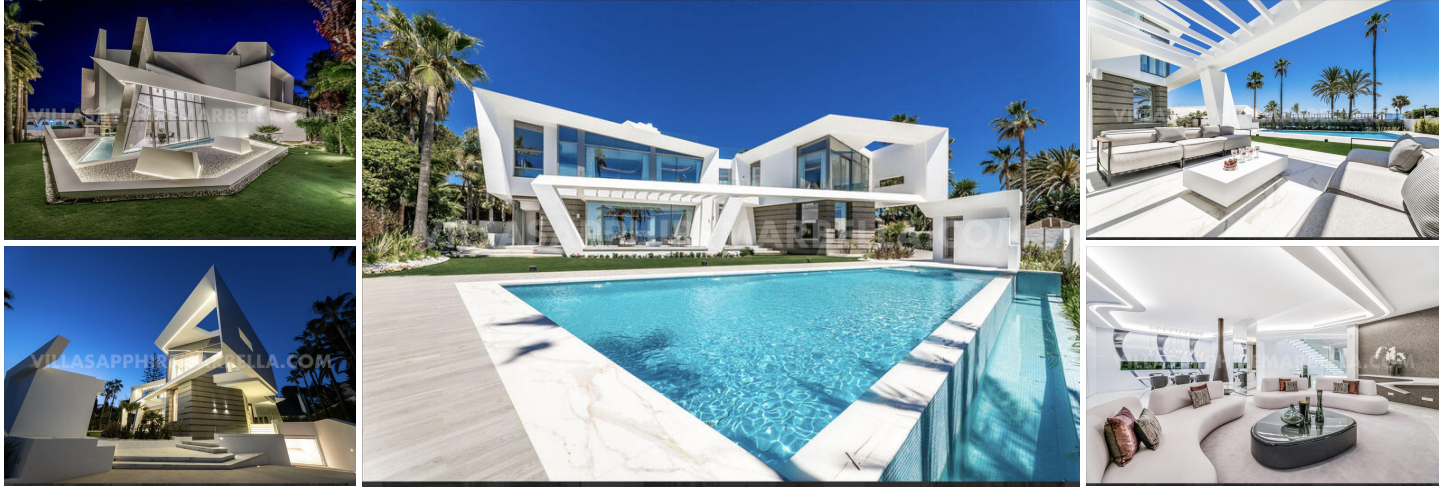
Villa SAPHIRE - First Line Beach - Los Monteros Playa

Welcome to Villa SAPHIRE, a true architectural masterpiece. This unique residence is located in the exclusive residential community of Los Monteros in Marbella.