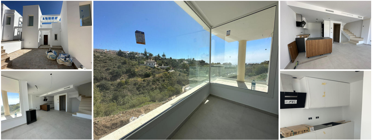
House NATURA - Sea and mountain views in Torreblanca

Great opportunity, 10 minutes from the beach! In a complex of 4 properties, we offer this charming terraced house offering extraordinary views.