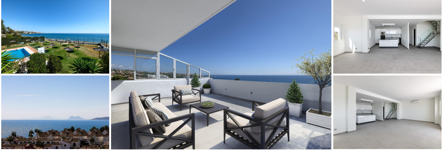
Duplex Penthouse beachfront - Estepona

Just outside Estepona, on the first line of the sea, we present to you this apartment with incredible views of the Mediterranean, Gibraltar and the African coasts.