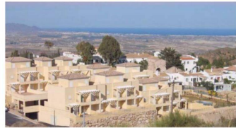
RESIDENCIAL LA FUENTE 4 VILLAS ADOSADAS CON GARAJE, ZONAS COMUNES Y PISCINA COMUNITARIA. CERCA A LA PLAYA DE BEDAR SL.