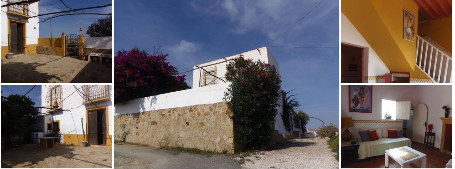
Cortijo with 3 bedrooms for sale in Mojacar.

Beautiful farmhouse in the town of Mojacar with a special charm, the house is perfectly preserved consists of two floors that are distributed as follows; ground floor super hall with access to the upper floor, large living room with fireplace, bathroom, dining room and fully equipped kitchen. On the upper floor we can find three double bedrooms, bathroom and terrace with stunning views of Mojacar Pueblo, valley and the Sierra Cabrera mountains.