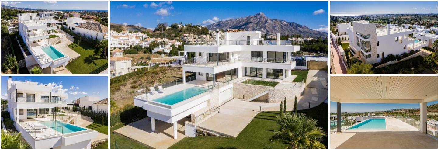
Villa near Los Naranjos Golf Club.

New Contemporary style Villa recently finished, facing west and built to the highest standards of finish. Situated on a quiet dead end street, on a high plot, with lovely views of the valley and the sea. On clear days you can see Gibraltar and the mountains of Morocco.