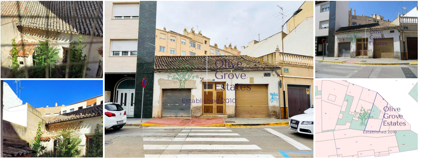
Townhouse in the center of Almansa (Albacete)

The plot is 183m 2 and is located 300m 2 from the castle of Almansa and only 200m 2 from Calle Rambla de la Mancha, which is the street where all the parades of the Fiestas de Mayo take place, and one of the most important and commercial streets of the town. It has pharmacies, supermarkets, bookshops, and the Garden of the Catholic Monarchs all within 300m 2