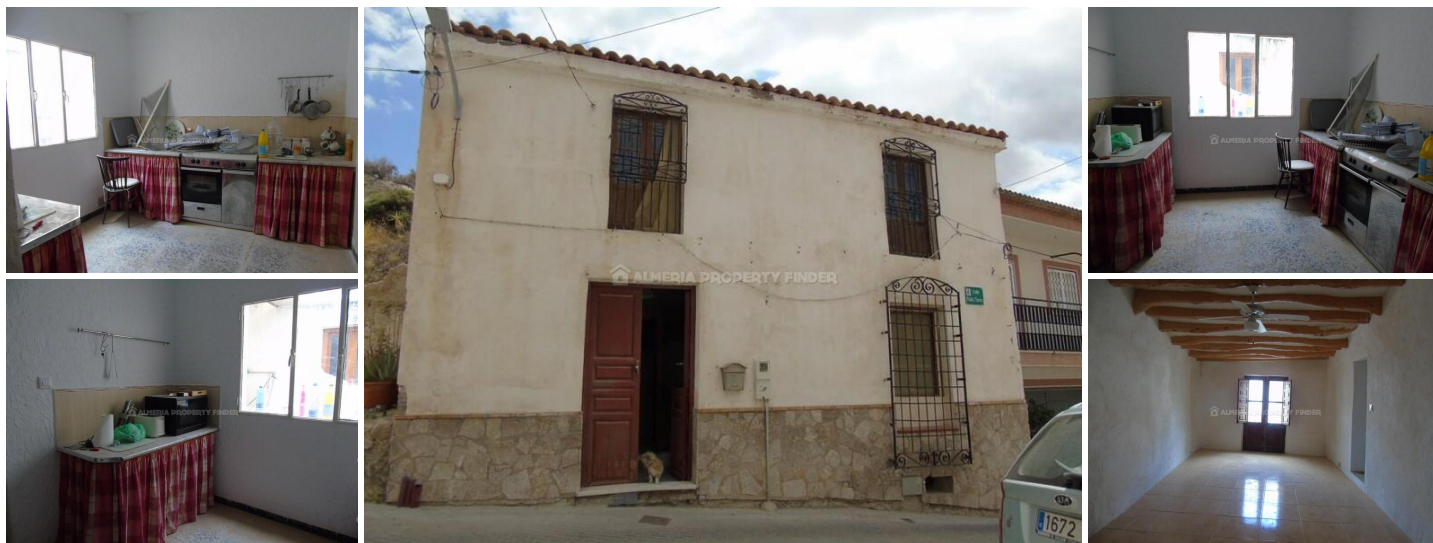
Casa Bodega - A town house in the Zurgena area. (Partially Reformed)

This large partly renovated 6 bedroom, 4 bathroom townhouse with a build of 300m 2 courtyard garden is for sale in situated in the old part of the small town of Zurgena, within easy walking distance of the town's amenities. Zurgena is a traditional Spanish village where the general hussle and bussle of village life is centered around the village square and it's bars which all serve tapas long into the evening. Other facilities include a kiddies' play park the newly constructed sports barn, 2 mini-markets, a bakers, 2 banks and two convenience stores.