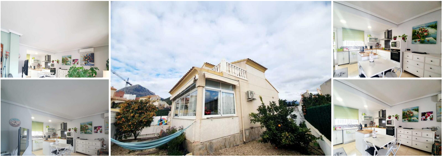
VILLA IN POLOP DE LA MARINA

Detached house in Polop, close to the commercial centre of Alberca, where there is supermarket, pharmacy, commercial premises and bar, restaurant, also there is fantastic park for all the family.