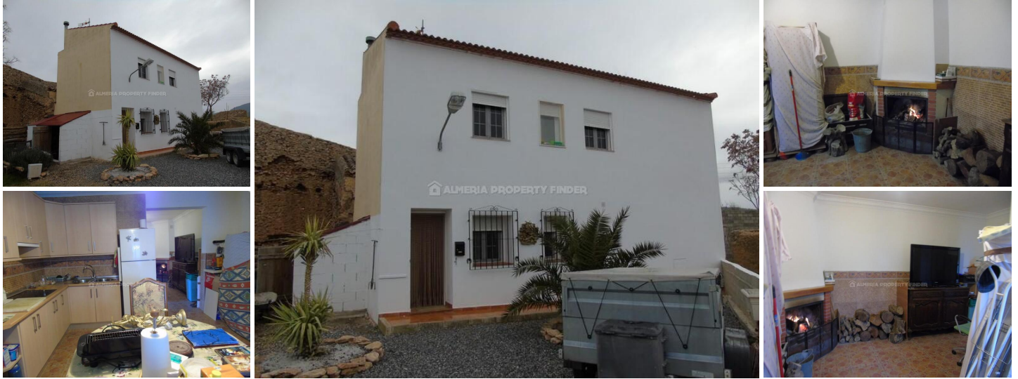
Cortijo Adela - A country house in the Oria area. (Resale)

A great two storey 3 bedroom, 2 bathroom country house with a build of 105m 2 situated in a very small neighborhood with a few other houses 10 minutes away from the traditional Spanish town of Oria which offers all amenities including supermarkets, bars, restaurants, banks, bakery, butcher, 24 hour medical facilities, pharmacy, a petrol station, ironmongers and a weekly market every Sunday.