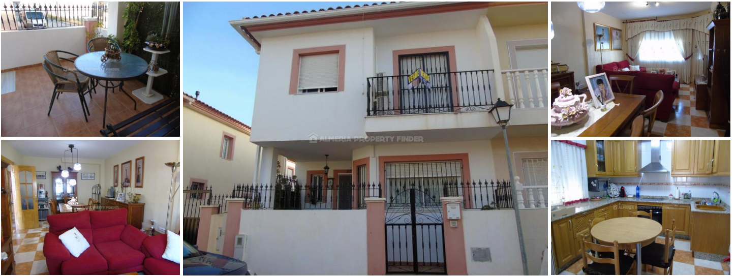
Casa Agueda - A duplex in the Albox area. (Resale)

A superb, spacious and modern 4 bedroom, 2 bathroom duplex belonging to a small community with an underground double garage situated in the popular market town of Albox. With a build size of 120m 2 , this bright and spacious two storey property is situated within easy walking distance of all amenities including shops, supermarkets, schools, cafes, tapas bars, restaurants, sports facilities, weekly markets and a 24 hour medical centre.