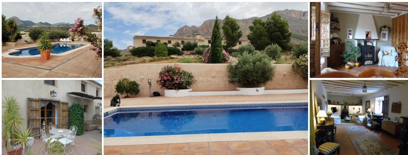
Cortijo Don Dionisio - A country house in the Velez-Blanco area. (Renovated)

An amazingly beautiful 400 year old fully renovated Spanish cortijo for sale on the edge of the Sierra Maria los Vélez, near the Andalusian village of Vélez Blanco, on the edge of the beautiful natural park Sierra Maria los Vélez. The house is surrounded by a beautifully landscaped garden and has a fabulous view of the valley of Vélez Blanco.