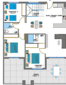
VIVIENDA TIPO C