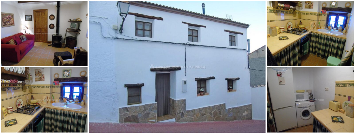
Casa Camilo - A town house in the Albánchez area. (Renovated)