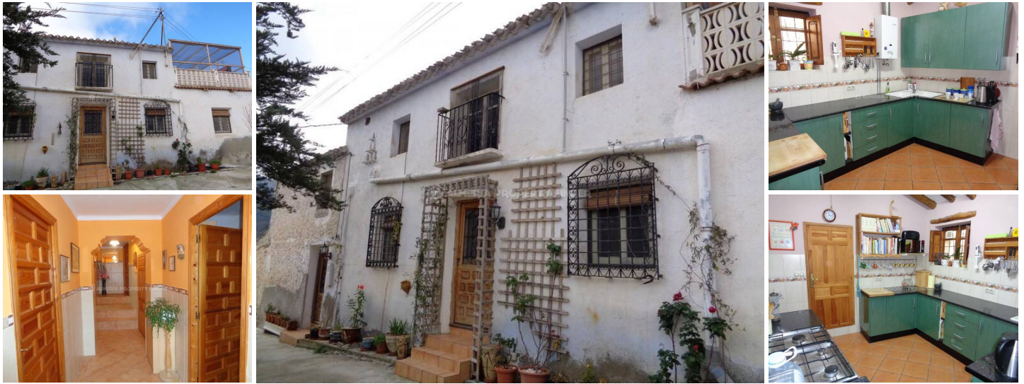
Casa Avril - A country house in the Oria area. (Renovated)

Fully renovated 4 bedroom country house with two storey garage and outbuildings for renovation. This terraced property forms part of a small hamlet near to the village of los Cerricos which has a bar / restaurant and a supermarket, and is around 25 minutes drive from the towns of Oria and Chirivel which offer all amenities.