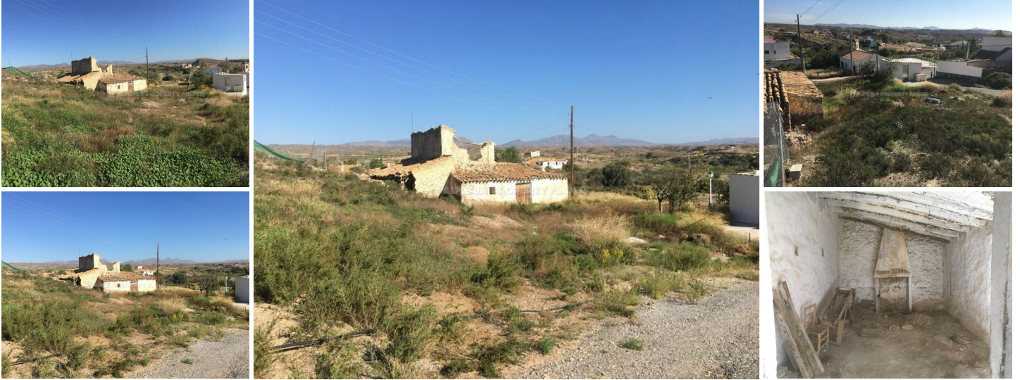
Parcela Toni - Land in the Partalooa area.

Urban building plot of 456m 2 situated in the Cerro Gordo area of Partalooa in Almería Province.