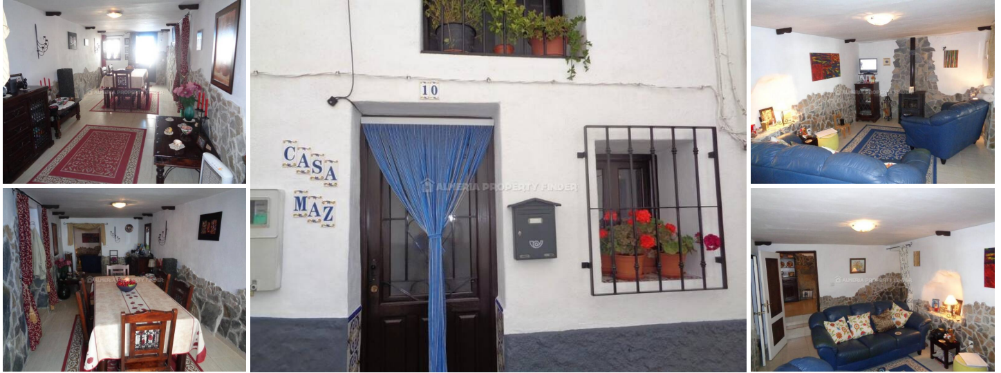
Casa Maz - A town house in the Somontin area. (Renovated)

Fully renovated 4 bedroom townhouse with garden for sale in Almeria, situated in the typically Spanish hillside town of Somontin, within walking distance of amenities.