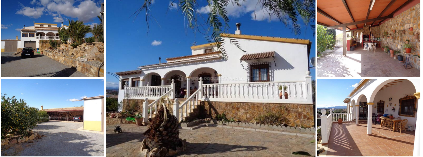
Casa Berbel - A country house in the Albox area. (Resale)

Fantastic detached 7 bedroom country house for sale in Almeria, situated in the Albox area. This huge property has a build size of around 500m 2 , and is set in a plot of 4000m 2 planted with orange, lemon, olive, almond, pear, fig and apple trees, along with grape vines.