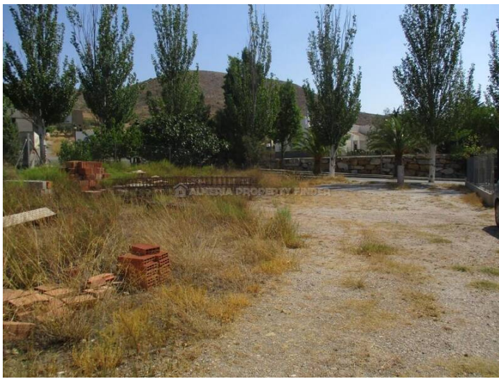
Parcela Agostino - Land in the Oria area.

Flat plot of 654m2 with two garages for sale in Almeria Province, situated just outside the traditional town of Oria which offers all amenities.