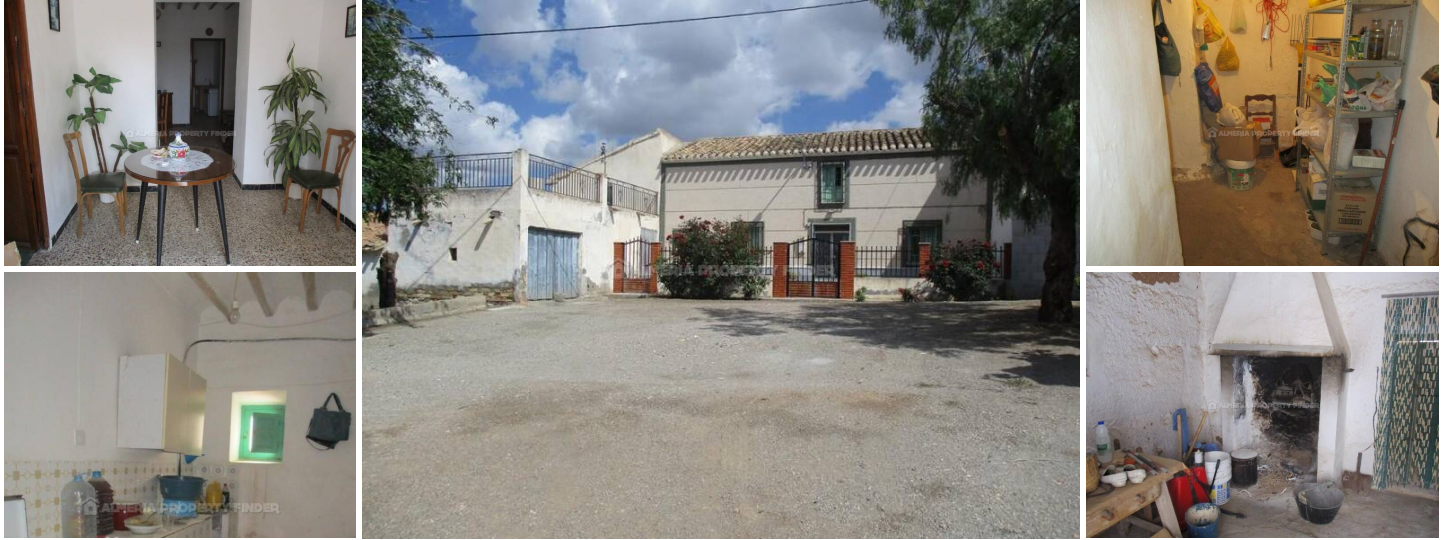
Cortijo Matias - A country house in the Oria area. (Habitable)

Habitable 4+ bedroom country property for sale in Almeria Province, situated on the Rambla de Oria around 15 minutes drive from the towns of Oria and Albox, both of which offer a wide range of amenities including shops, supermarkets, tapas bars, restaurants, schools and 24 hour medical centres.