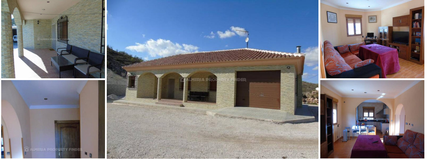
Villa Topa - A villa in the Oria area. (Resale)

Delightful 3 bedroom villa with integral garage and stunning views, situated in a tranquil rural area, 1km from the sleepy village of los Cerricos. The village offers basic amenities including tapas bars and a shop, and there are regular delivery vans offering bread, fish, meat and frozen goods. The small town of Chirivel is a 14 minute drive and the town of Oria is a 20 minute drive.