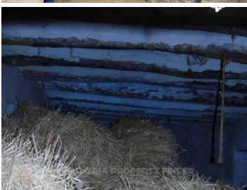
Cortijo Gloria - A village house in the Chirivel area. (For Renovation)

For complete renovation, this two storey village house has the potential to become a lovely 2/3 bedroom family home. The property is situated in a small rural hamlet around 7 minutes drive from the lovely town of Chirivel which offers all amenities for daily living.