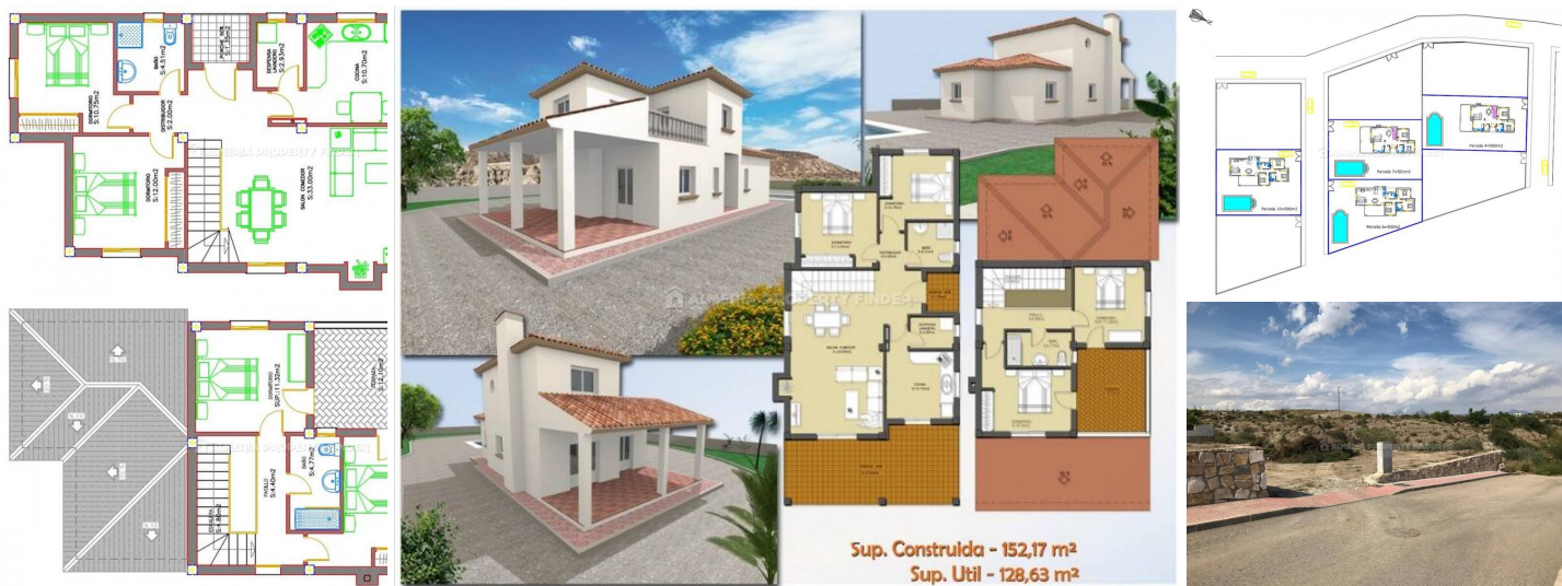
Villa la Ermita 3 - A villa in the Huercal-Overa area. (Off Plan)

Off Plan: High quality 3 bedroom villa of 152.17m 2 construction to be set in a choice of 4 plots of around 500m 2 in the Huercal Overa area.