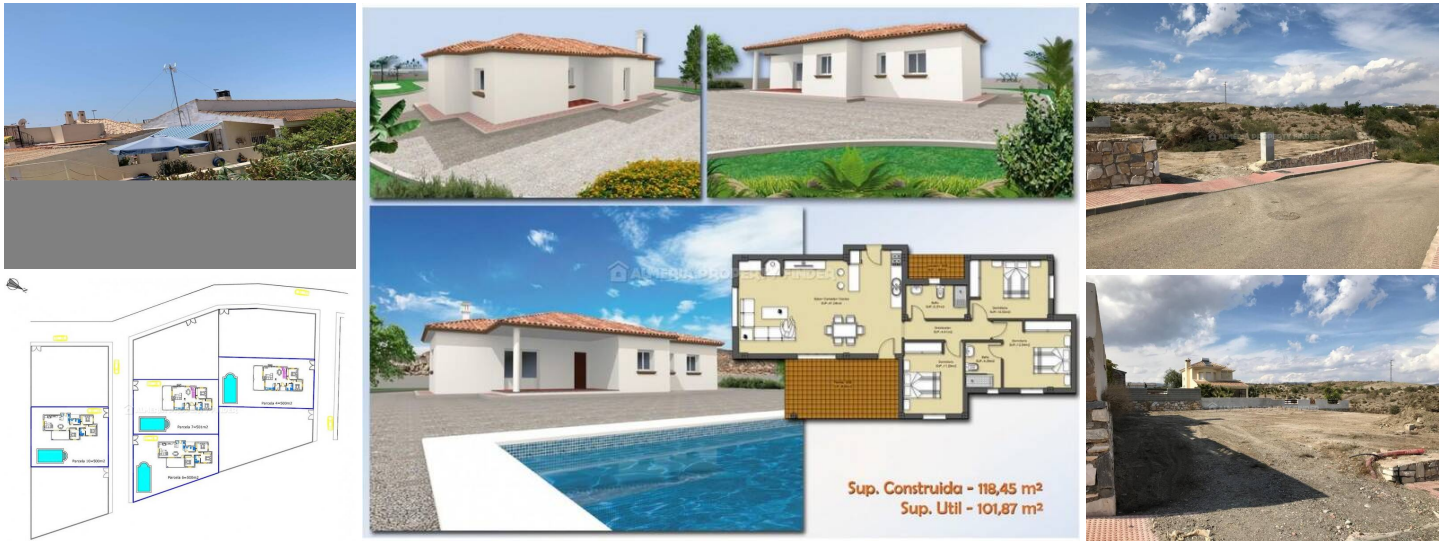
Villa la Ermita 1 - A villa in the Huercal-Overa area. (Off Plan)

Off Plan: High quality 3 bedroom villa of 118.45m 2 construction to be set in a choice of 4 plots of around 500m 2 in the Huercal Overa area.