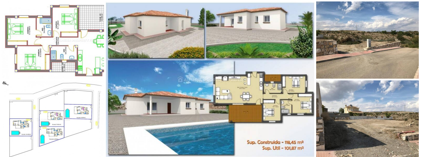
Villa la Ermita 1 - A villa in the Huercal-Overa area. (Off Plan)

Off Plan: High quality 3 bedroom villa of 118.45m 2 construction to be set in a choice of 4 plots of around 500m 2 in the Huercal Overa area.