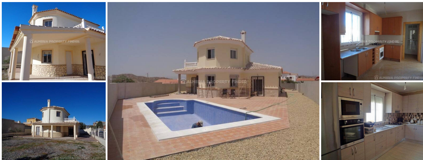
Villa Antonietta 3 - A villa in the Arboleas area. (Off Plan)

Off plan : Spacious 3 bedroom, 3 bathroom villa to be constructed on the edge of the popular village of Arboleas.