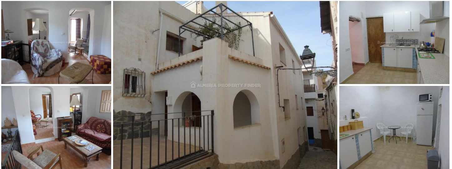
Casa Valeria - A village house in the Purchena area. (Renovated)

A charming terraced 4 bedroom village house with a build of 116m 2 for sale in Almeria province located in the pretty town of Sierra which offers all amenities for daily living of doctors, gym, church, 2 bars, 2 shops for bread and butchers, municipal swimming pool, primary school, and a secondary school in Purchena and 15 minutes drive from Mercadona in Olula Del Rio.