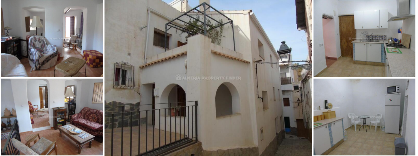
Casa Valeria - A village house in the Purchena area. (Renovated)

A charming terraced 4 bedroom village house with a build of 116m 2 for sale in Almeria province located in the pretty town of Sierrro which offers all amenities for daily living of doctors, gym, church, 2 bars, 2 shops for bread and butchers, municipal swimming pool, primary school, and a secondary school in Purchena and 15 minutes drive from Mercadona in Olula Del Rio.