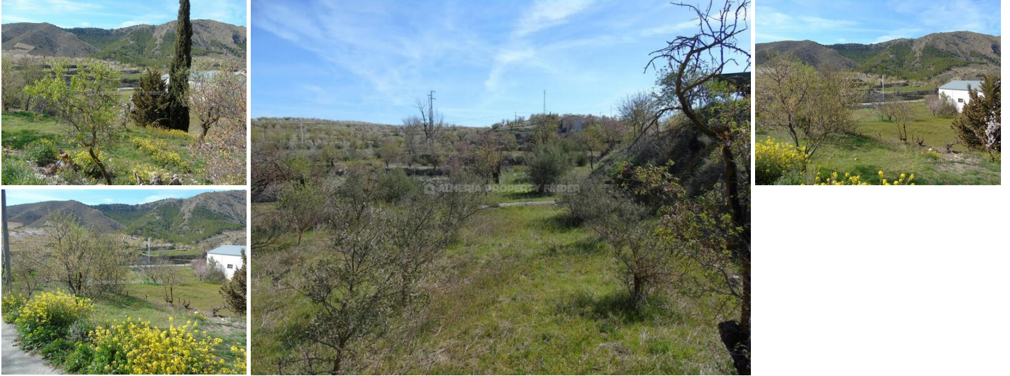
Terreno Francisco - Land in the Oria area.

Land for sale in the outskirts of the rural village of El Margen, around 10 minutes drive from the traditional town of Oria which offers all amenities.