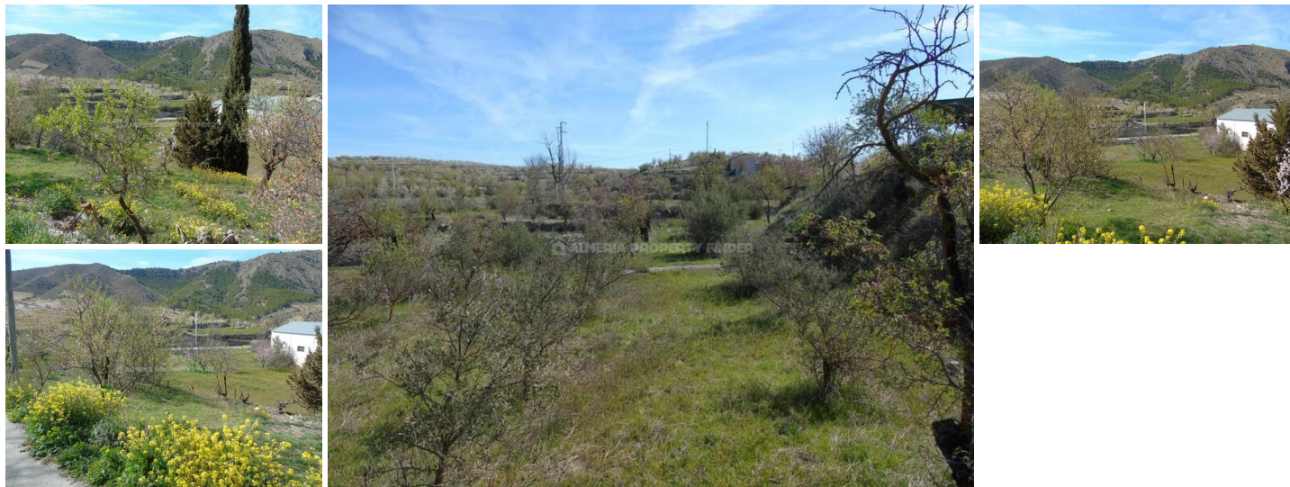
Terreno Francisco - Land in the Oria area.

Land for sale in the outskirts of the rural village of El Margen, around 10 minutes drive from the traditional town of Oria which offers all amenities.