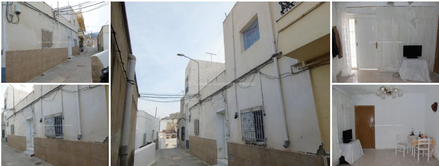
Casa Polvorin - A town house in the Macael area. (Habitable)

REDUCED!!! Two storey 3 bedroom, 2 bathroom town house with roof terrace and courtyard garden, situated in the town of Macael in Almeria Province. Set in a plot of 196m 2 , the house has a total build size of 164m 2 including a large roof terrace with views across the town to the hillsides beyond. There is also 43000m 2 land with olive trees included.