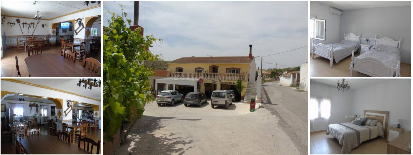
Bar Remedios - A commercial in the Oria area. (Resale)

Excellent opportunity to purchase a bar/restaurant with separate accommodation in the centre of the traditional Spanish village of Los Cerricos.