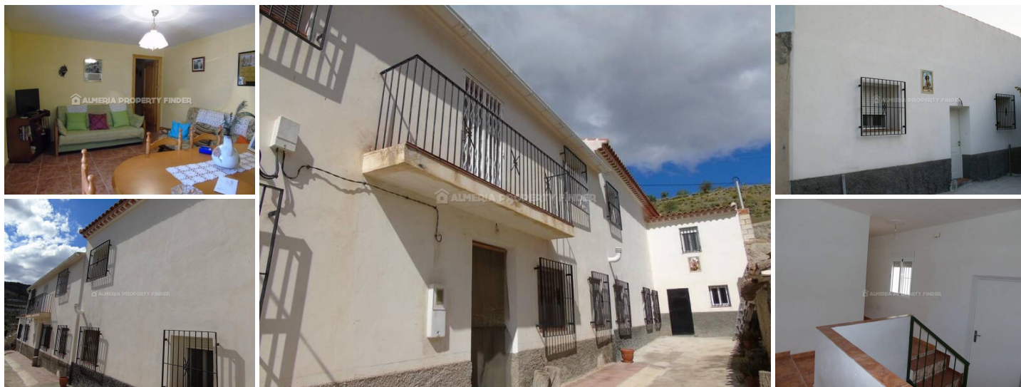
Casa los Finos - A village house in the Oria area. (Renovated)

Reduced for quick sale! Fabulous 5/6 bedroom village house situated in a small rural hamlet near to the village of los Cerricos which has a supermarket and tapas bars. The hamlet is serviced by various mobile shops and the towns of Oria & Chirivel which offer all amenities are around a 20 minute drive.