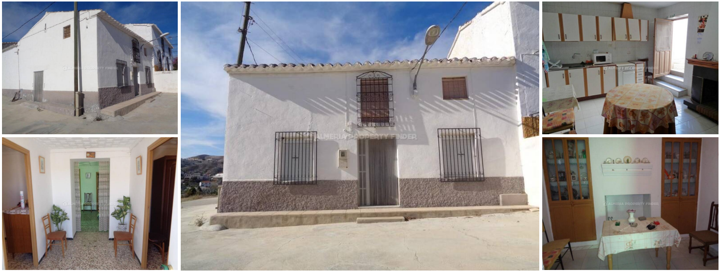
Casa Chacones - A village house in the Oria area. (Partially Reformed)

Part reformed 3+ bedroom country house for sale in Almeria, situated on the edge of a village in the Rambla de Oria.