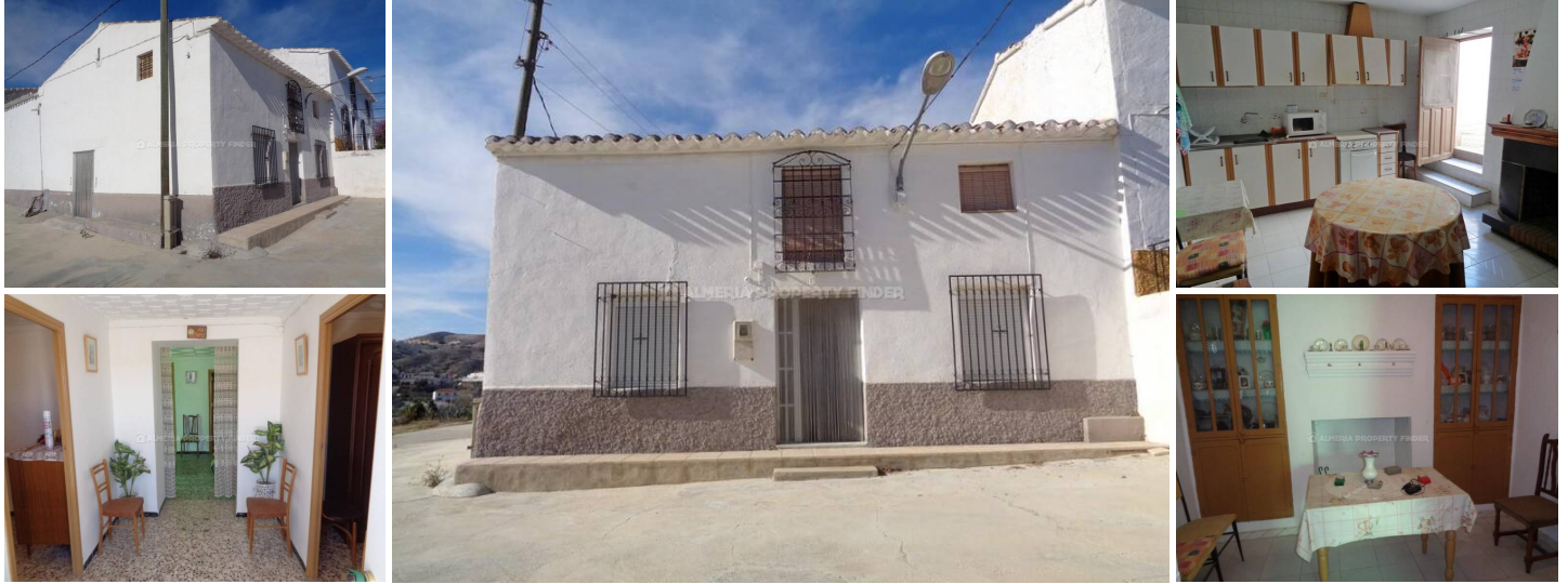
Casa Chacones - A village house in the Oria area. (Partially Reformed)

Part reformed 3+ bedroom country house for sale in Almeria, situated on the edge of a village in the Rambla de Oria.