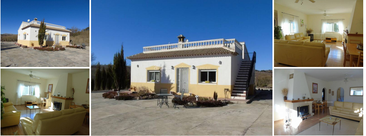
Villa Madina - A villa in the Oria area. (Resale)

Detached 3 bedroom villa in a beautiful rural setting with only two neighbours, situated just outside the sleepy hamlet of El Margen. The villa is only 3km from a village with bars / restaurants, and around 15 minutes drive from the towns of Oria and Chirivel which offer all amenities.