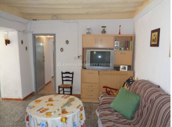
Casa de Amador - A town house in the Partaloa area. (Habitable)

Large habitable 2+ bedroom townhouse for sale in Almeria Province, situated in the charming town of Partaloa. The property is completely habitable but in need of some modernisation / renovation work, and has the potential to become a large family home with up to 6 bedrooms.