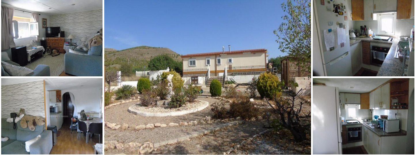
Casa Mia - A park home in the Oria area. (Resale)

This is a great opportunity to buy a holiday home or a permanent residence in the sun with a smaller budget!