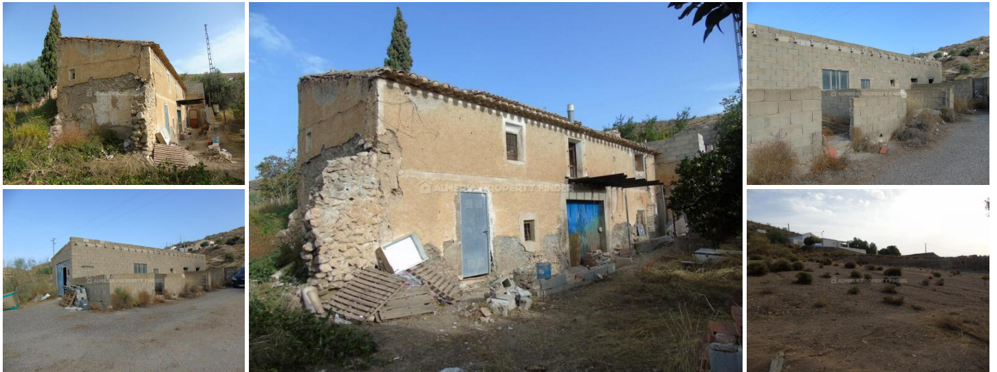
Cortijo Molino - A country house in the Albox area. (For Renovation)

A great opportunity for anyone looking for a renovation project.