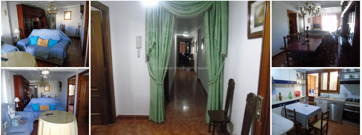
Apartamento Burra - An apartment in the Albox area. (Resale)

A super opportunity to purchase a 4 bedroom, 2 bathroom second floor apartment located in the popular area of Albox and within easy walking distance to all amenities including a wide variety of shops, supermarkets, banks, post office, tapas bars, cafes, restaurants, 24 hour medical centre, sports facilities and two weekly markets.