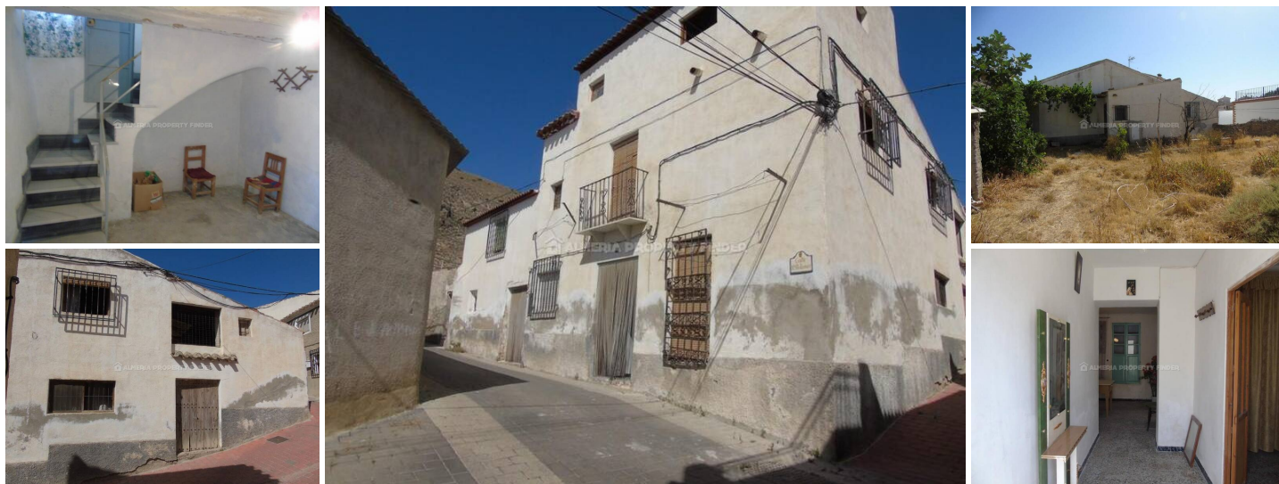
Casa Luciana - A town house in the Oria area. (Partially Reformed)