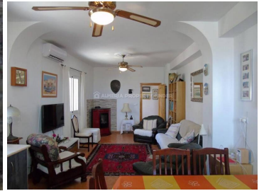
Casa Manzanilla - A country house in the Caniles area. (Renovated)

** REDUCED AND OPEN TO SENSIBLE OFFERS **