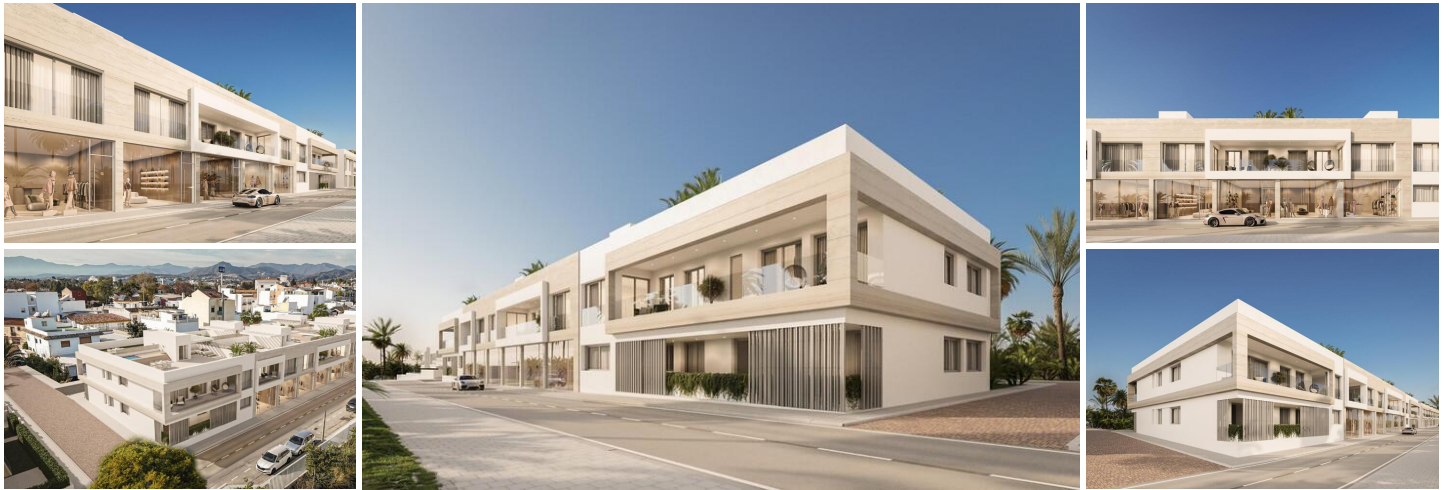
Luxury New Build Villas, Apartments and Townhouses in San Pedro de Alcantara Marbella