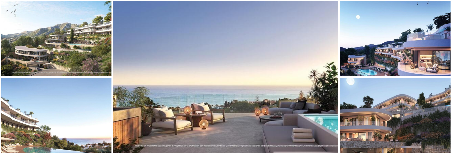
Luxury New Build Townhouses for Sale in Las Lomas del Higueron with Sea Views and Private Pools