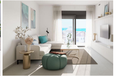
COSTA GALERA CULMIA

Enjoy your new home by the sea in one of the best areas of the Costa Tropical.